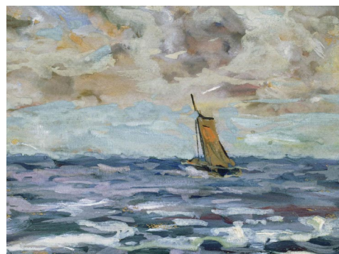
Hans von Bartels, Zeegezicht , 1904. Objectnumber NK3282, 17,5 x 22,2 cm.

In pursuit of provenance is a monthly blogs series focusing on provenance research into an object from the Netherlands Art Property Collection (NK Collection). The collection consists of artworks that were returned to the Netherlands after World War II, including paintings, works on paper and applied arts such as furniture and ceramics. By giving a significant boost to research, we hope to uncover new provenance information. The February blog post highlights a traditional Zeeland pocket knife, the March blog post examines a wool Karabakh runner rug with a floral motif, a seascape with sailboat is the subject of the April blog post and the May blog post focuses on a glass goblet.