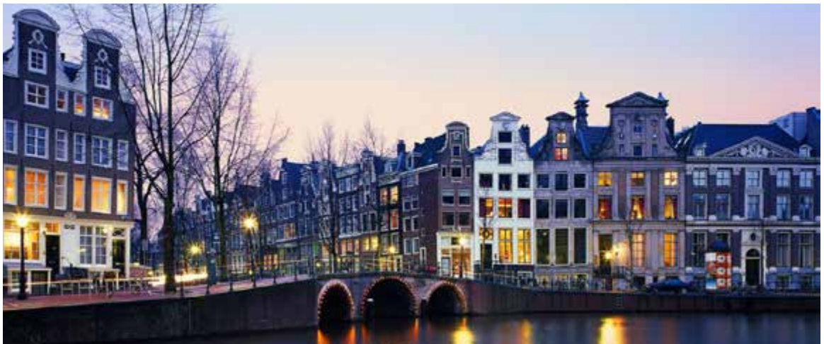
Photo 3: Historic inner city of Amsterdam, the Netherlands.

"Historic buildings are the gems of a city, the legacy of history and culture and a testimony of social changes. They give a sense of belonging and reinforce cultural identity among the community." (Report on the Policy Review on Conservation of Built Heritage, Antiquity Advisory Board, Hongkong, 2014.)