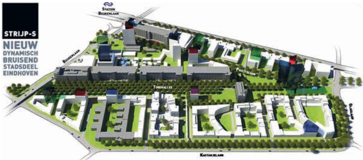
Illustration 2: Map picturing the desired situation for Strijp-S by 2030.