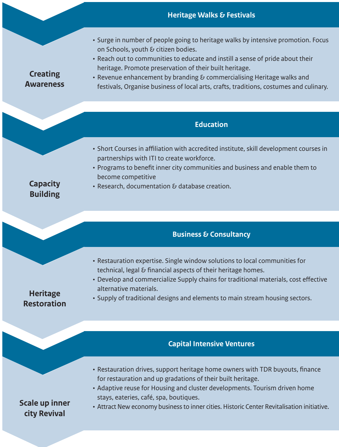
Illustration 1. The City Heritage Centre's 'Heritage Value Chain'.

The solution City Heritage Centre seeks is to implement an 'Economic Model' in local context.