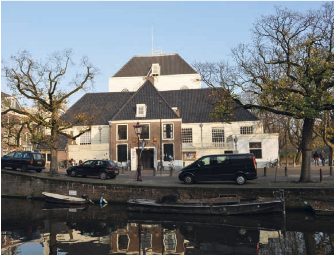
Photo 6: Example of adaptive reuse in Amsterdam. From protestant church to Stadsherstel office building.

holders to invest in the company. Although Stadsherstel opposed the city policy and its philosophy in the starting period, after a decade or so the city of Amsterdam adapted its policy and became shareholder and ally in 1968.