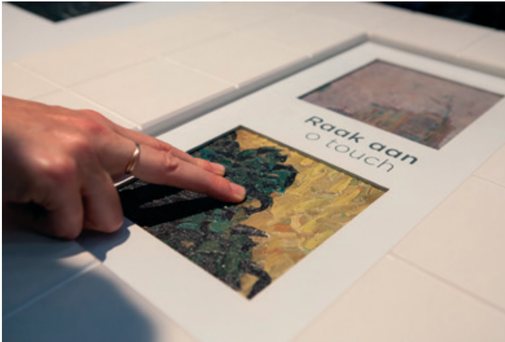
3D prints of details of paintings by Vincent van Gogh in the 'Van Gogh at work' exhibition (Van Gogh Museum).

in on details, something we can only approximate in a museum by examining the painting closely with a magnifying glass, which of course is not allowed for security reasons.