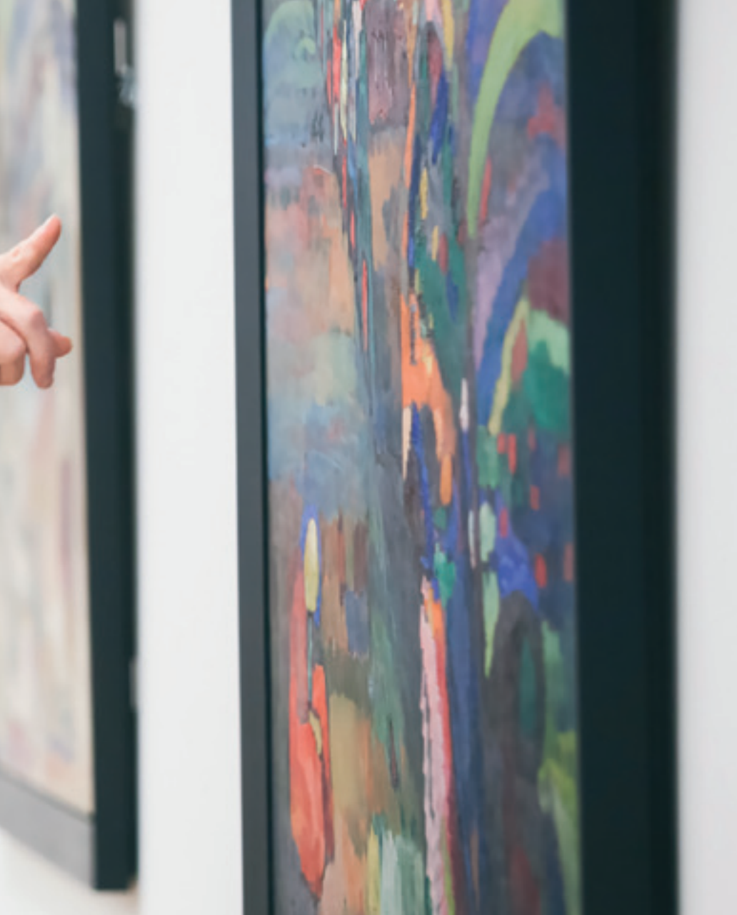
The Stedelijk Museum Amsterdam makes art accessible for people with Alzheimer's (and other forms of dementia) and their carers.