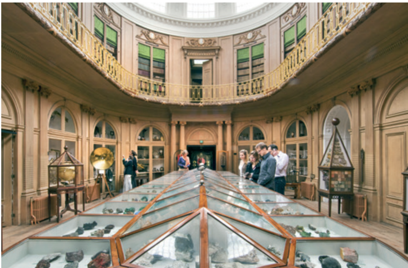
The Oval Room in Teylers Museum today.

‘Museums made an enormous contribution to the professionalisation of knowledge and scholarship, especially in the nineteenth century’