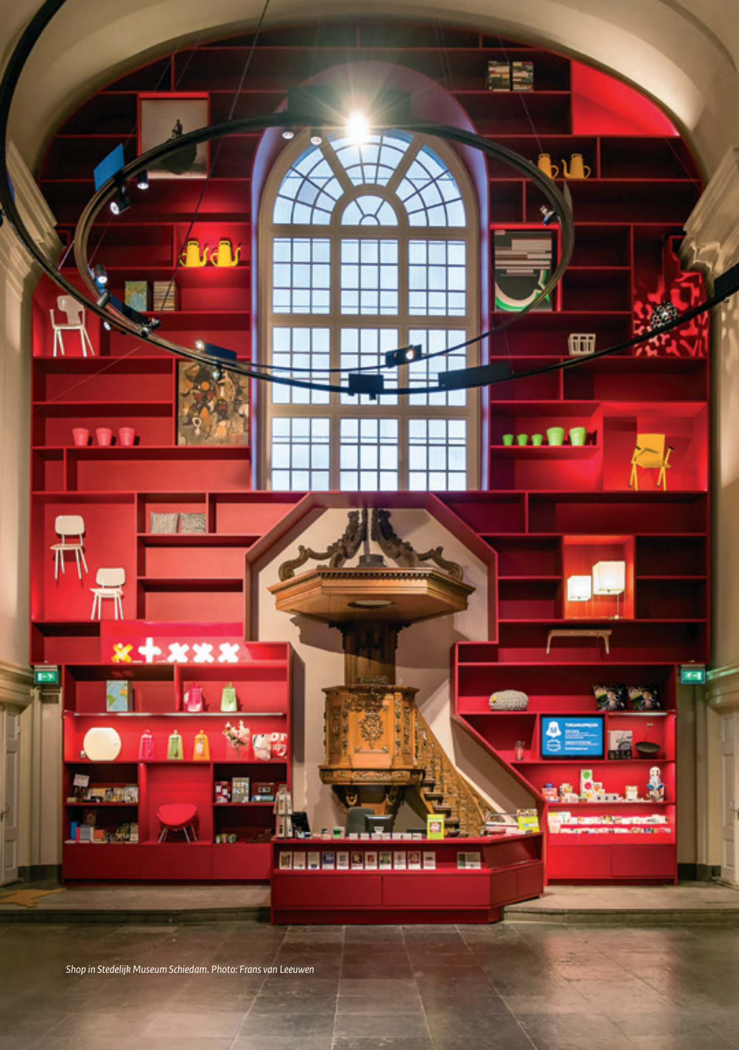
Shop in Stedelijk Museum Schiedam.