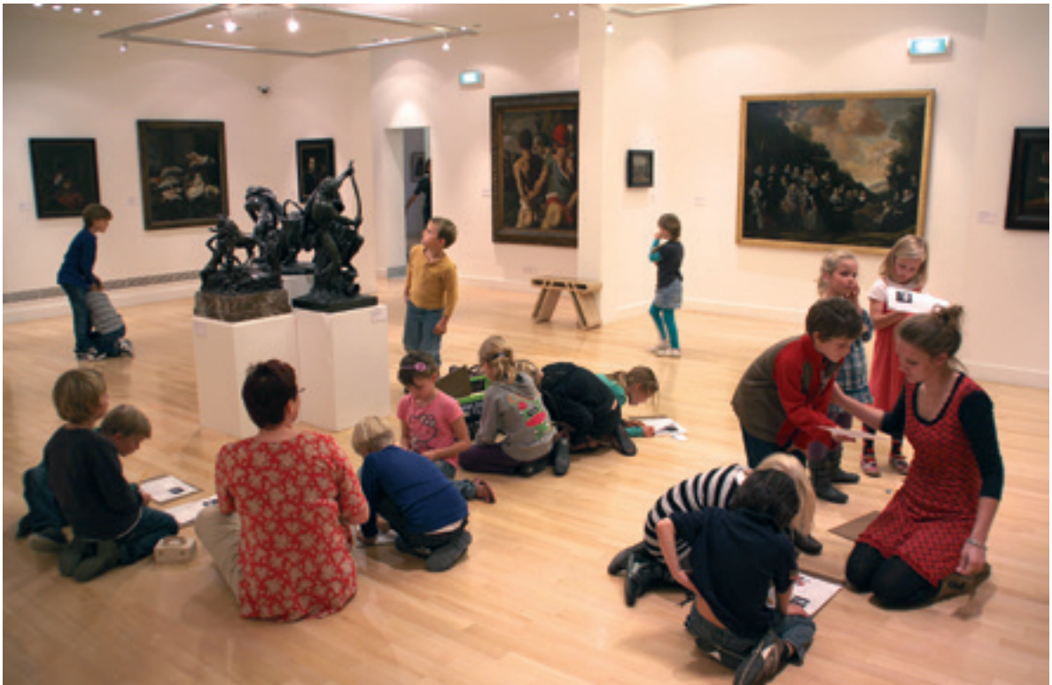
Museum De Fundatie, Zwolle

ous major Dutch museums as well as the Cultural Heritage Agency, presented its art history research agenda ('Perspectief. Onderzoeksagenda Kunstgeschiedenis'). OSK emphasised its wish to draw up a coherent research agenda 'in which, for example, collaboration between academic researchers and extra-university research centres (including museums) features prominently, including in the area of academic training'.