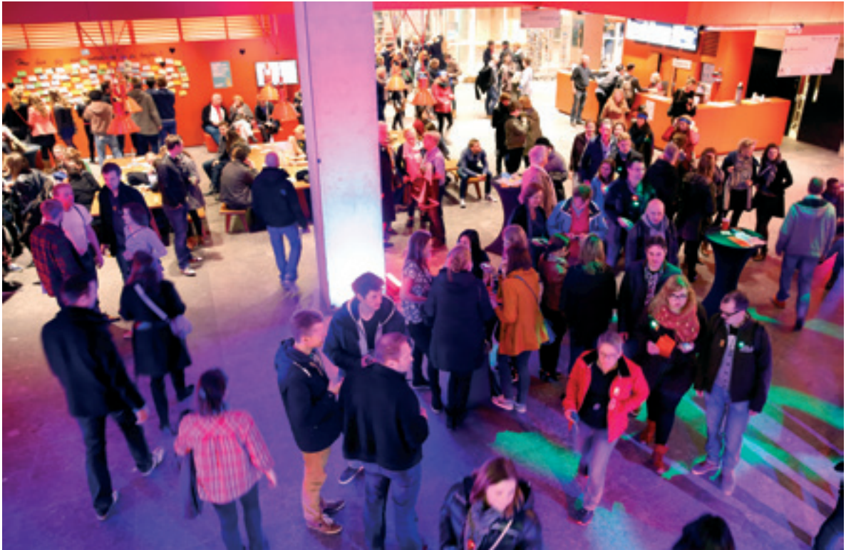
Museum Night Rotterdam.

information is so abundantly available. Thus museums potentially occupy a growth market, but also one where they face growing competition from other forms of leisure activity, including commercial activity. The trick is to find their own unique place within that market. This will depend on the type of museum, its size, location and the opportunities afforded by its collection, etc. The future scenario outlined below sets out the possible aspects of tomorrow's museums.