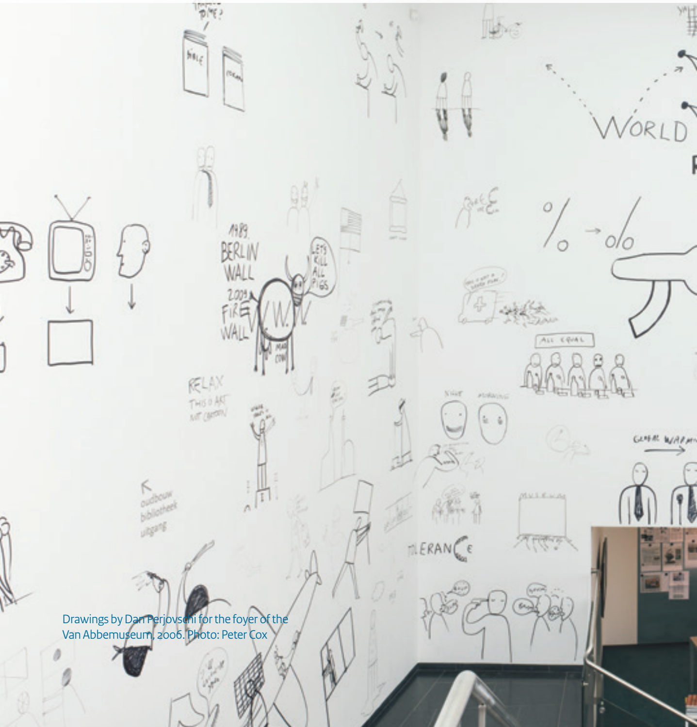
Drawings by Dan Perjovschi for the foyer of the Van Abbemuseum, 2006.