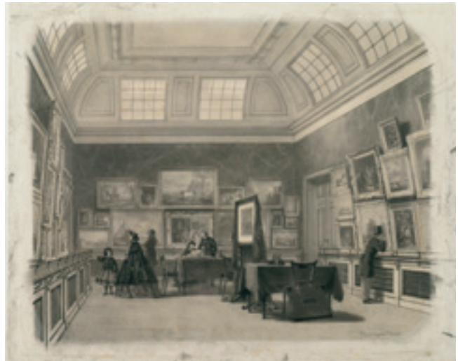
Drawing of the First Painting Gallery in Teylers Museum, Johan Conrad Greive (1837–1891), 1862

While the work of curators and academics may not be diametrically opposed, it is not the same either. This is because of the different aims that they strive