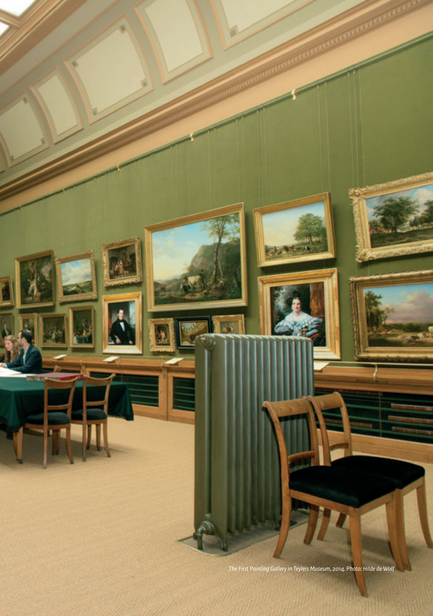
The First Painting Gallery in Teylers Museum, 2014.