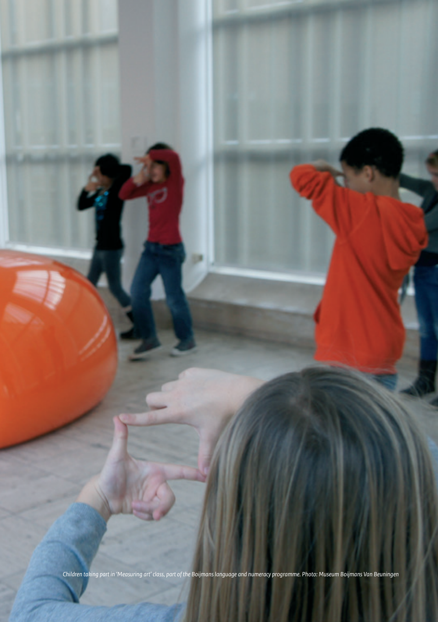
Children taking part in 'Measuring art' class, part of the Boijmans language and numeracy programme.