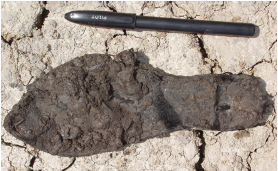
Sole of a 15 th -century shoe (uncleaned)