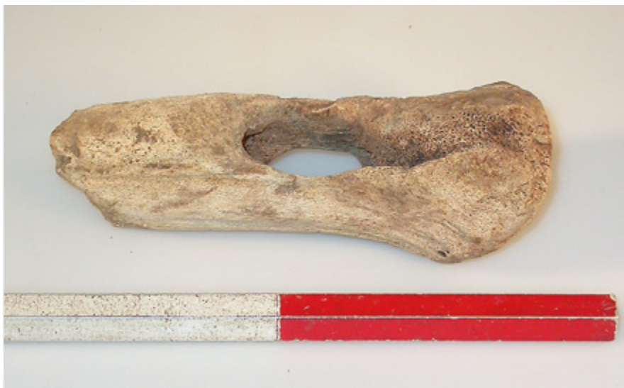
Prehistoric axe made of red deer antler