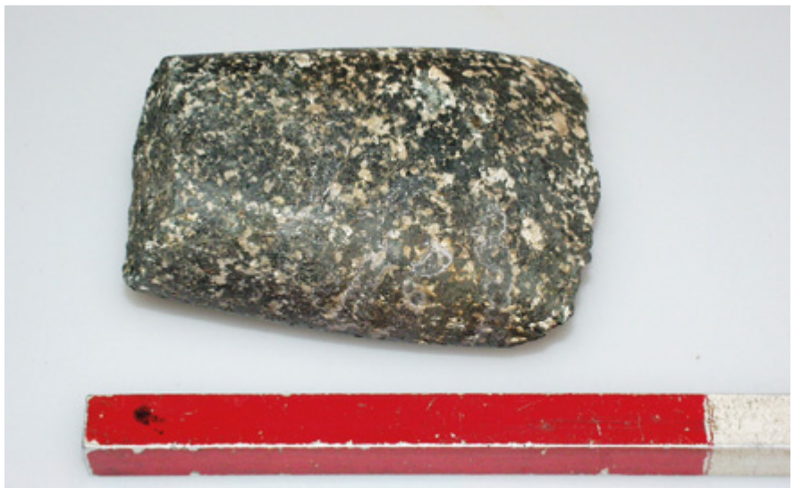
Fragment of a polished stone axe, c. 5000 BC