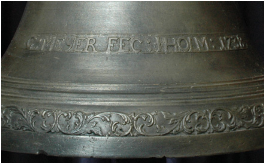
Detail of the inscription on the bell