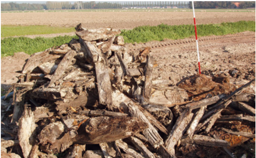
A ship archaeologist's nightmare: the piled up remains of a shipwreck