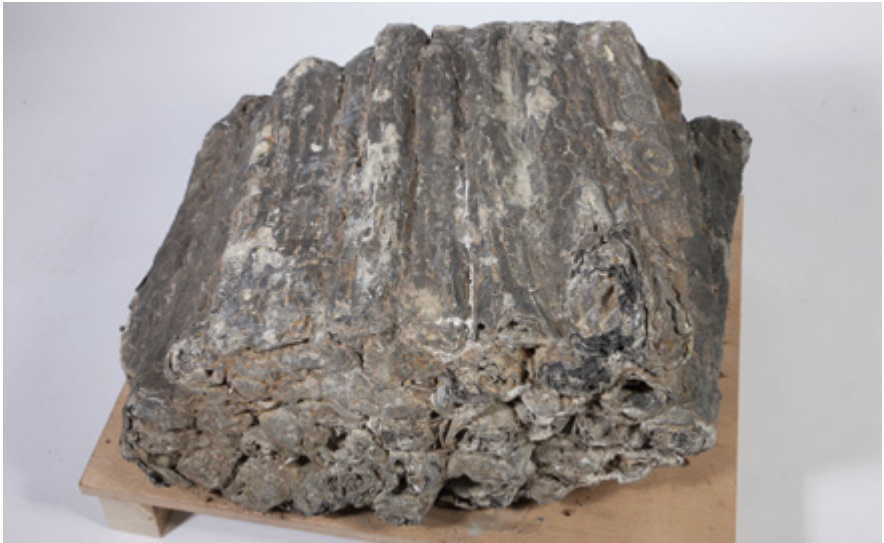
Part of a cargo consisting of rolls of tin plate