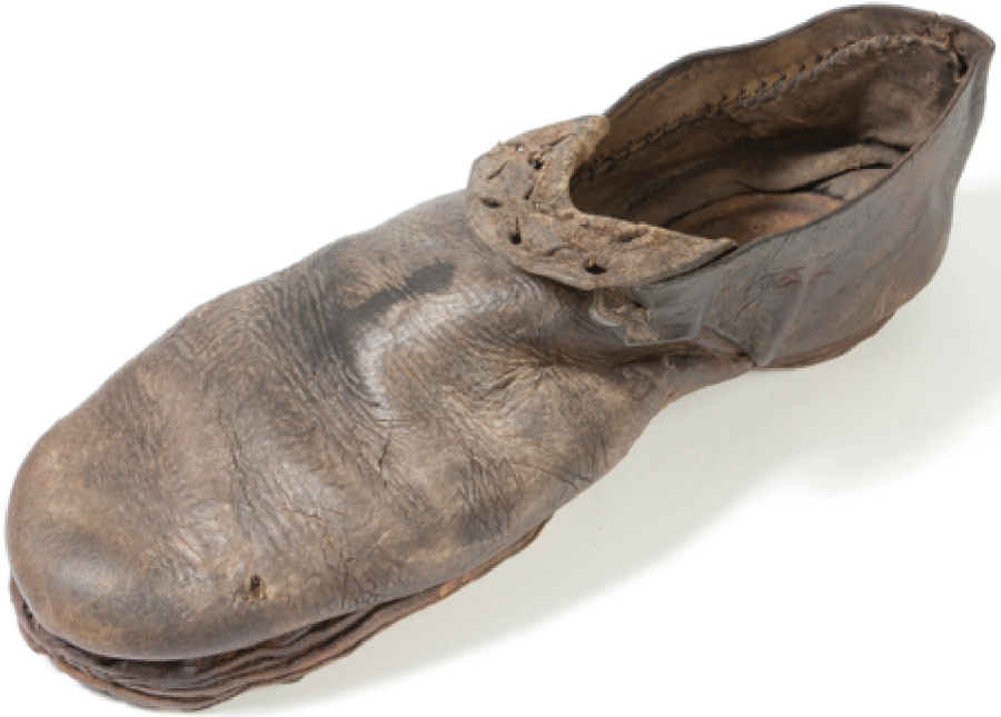
Restored 18 th -century leather shoe