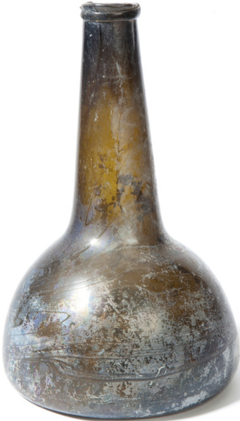
18 th -century wine bottle