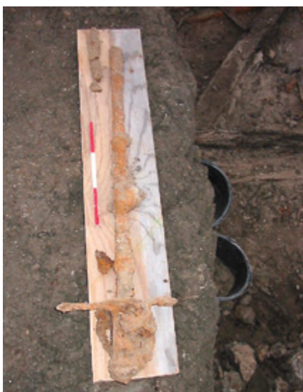
Above: 16 th -century rapier