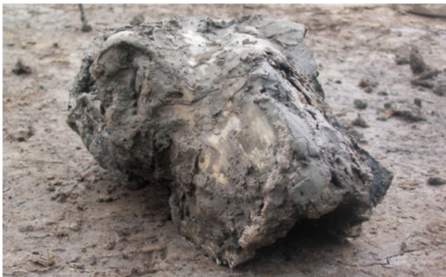
Skull of a Medieval cow (uncleaned)