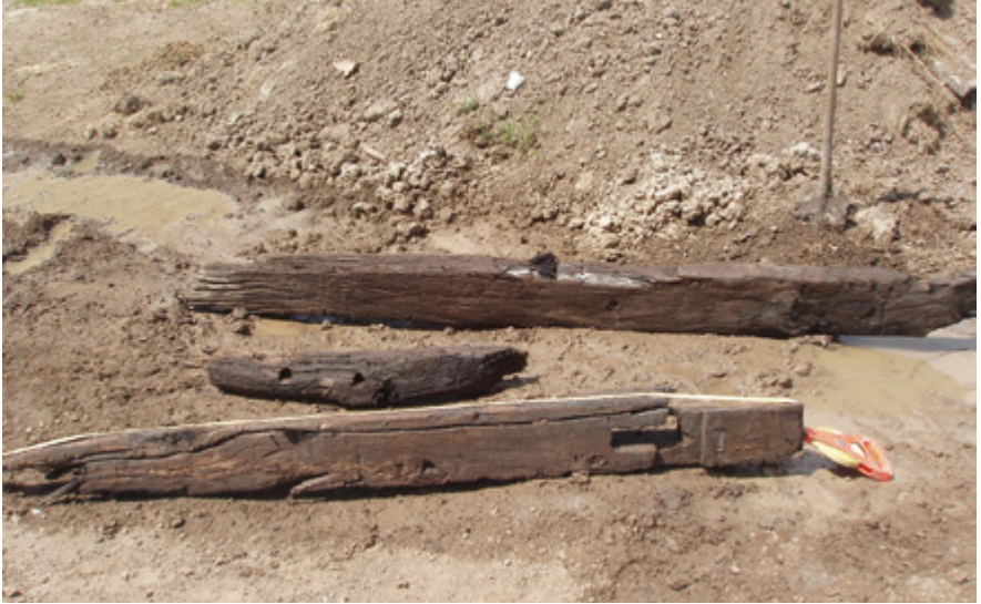
13 th -14 th -century construction timber