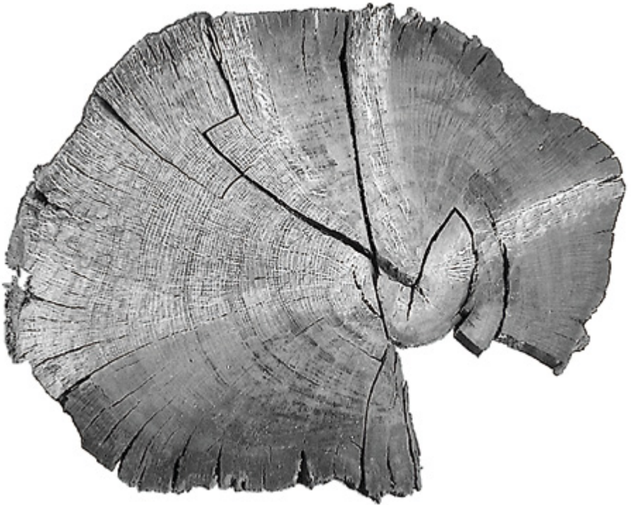
Section of tree trunk showing annual growth rings. This tree grew some 8000 years ago.