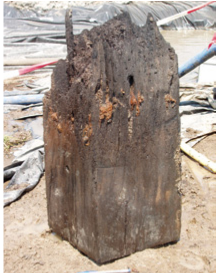
16 th -century bridge foundation post of oak