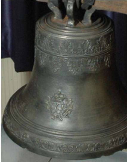
Ship's bell from the Sophia Albertina