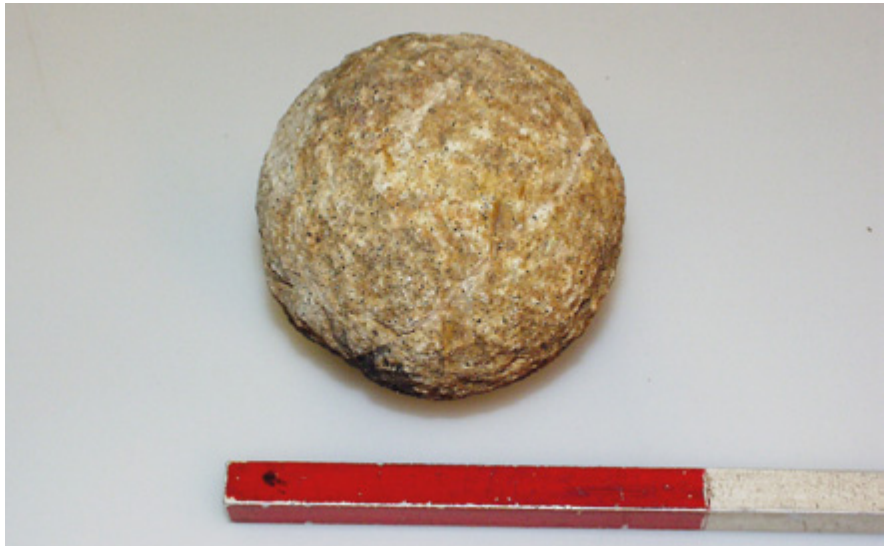
Stone cannonball, 14 th -15 th century