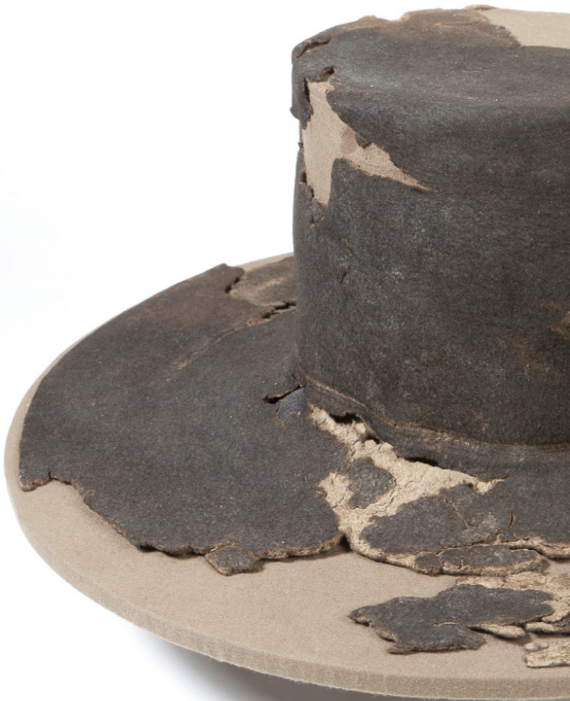
17 th -century felt hat