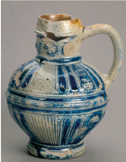
17 th -century stoneware