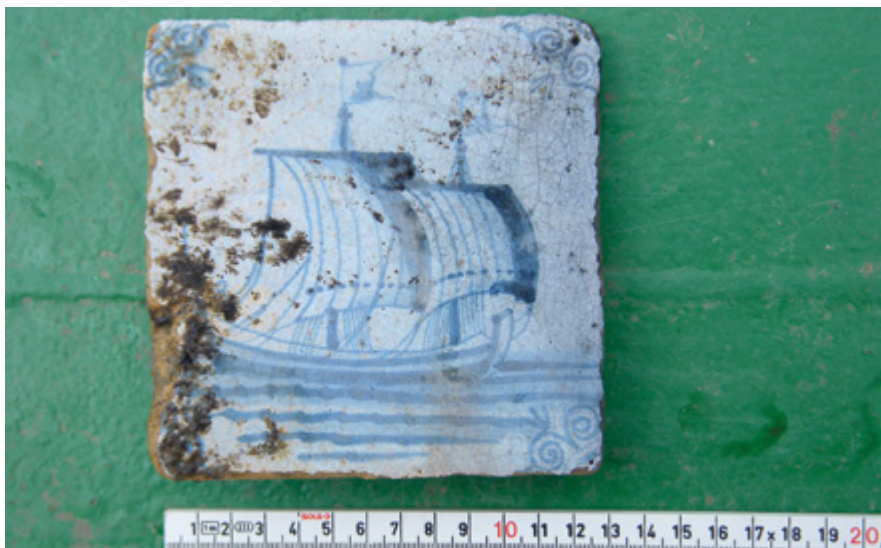
17 th -century wall tile