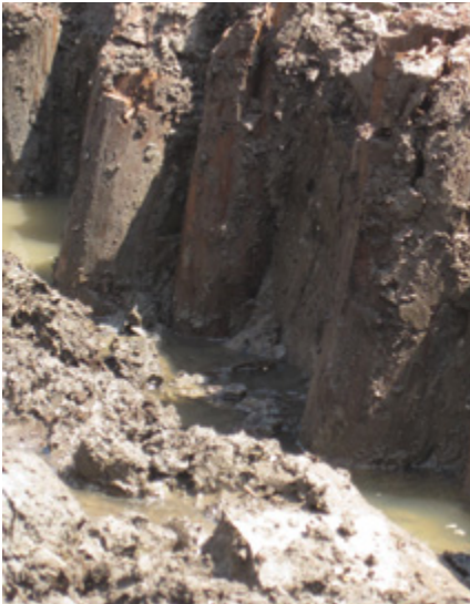
9 th -century revetment posts of alder