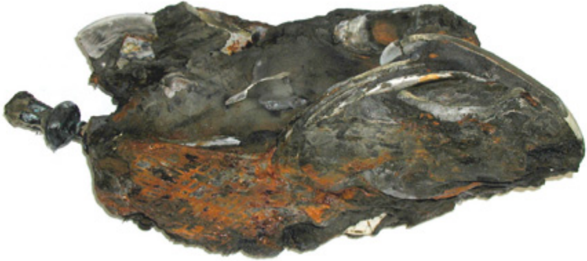
Unrecognisable due to corrosion: iron, glass and pottery