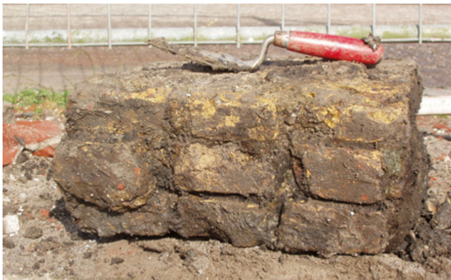
17 th -century brick