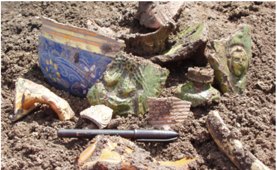
Various types of pottery from around 1600