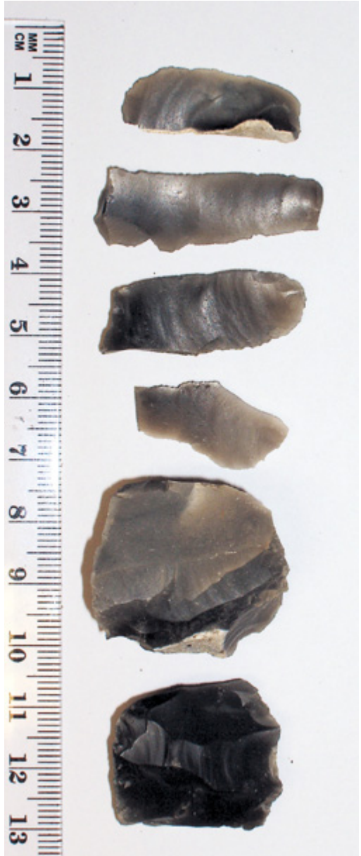
Late Mesolithic flint, some 8000 years old